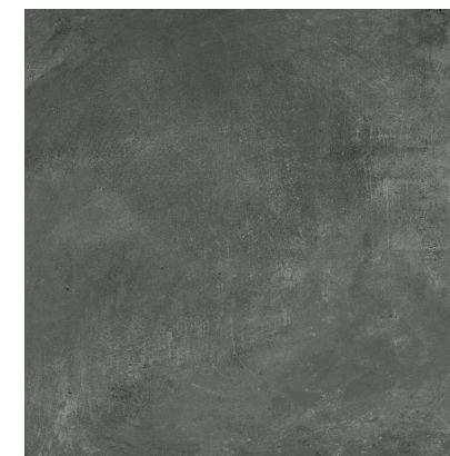
Newstreet Smoke 60 x 60cm . 23,6" x 23,6" / NW59 / C03 59 x 59cm . 23,2" x 23,2" / NW58 / C07 30 x 60cm . 11,8" x 23,6" / NW56 / C01 29,4 x 59cm . 11,6" x 23,2" / NW57 / C07 45 x 45cm . 18" x 18" / NW55 / C01 9,7 x 9,7cm . 3,9" x 3,9" / TNW58 / C17