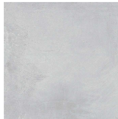
Newstreet Fog 88,6 x 88,6cm . 34,9" x 34,9" / NW12 / C13 60 x 60cm . 23,6" x 23,6" / NW19 / C03 60 x 60cm . 23,6" x 23,6" / NW13 / C04 59 x 59cm . 23,2" x 23,2" / NW18 / C07 30 x 60cm . 11,8" x 23,6" / NW16 / C01 29,4 x 59cm . 11,6" x 23,2" / NW17 / C07 45 x 45cm . 18" x 18" / NW15 / C01 9,7 x 9,7cm . 3,9" x 3,9" / TNW18 / C17