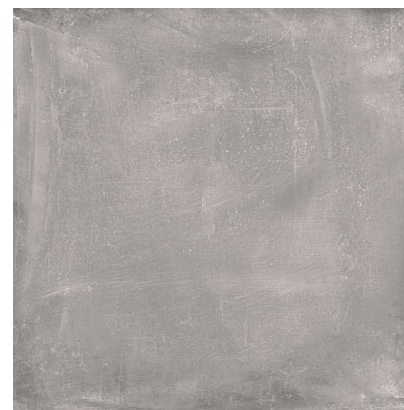
Newstreet Grey 88,6 x 88,6cm . 34,9" x 34,9" / NW42 / C13 60 x 60cm . 23,6" x 23,6" / NW49 / C03 60 x 60cm . 23,6" x 23,6" / NW43 / C04 59 x 59cm . 23,2" x 23,2" / NW48 / C07 30 x 60cm . 11,8" x 23,6" / NW46 / C01 29,4 x 59cm . 11,6" x 23,2" / NW47 / C07 45 x 45cm . 18" x 18" / NW45 / C01 9,7 x 9,7cm . 3,9" x 3,9" / TNW48 / C17