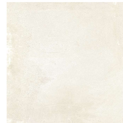
Newstreet Pearl 60 x 60cm . 23,6" x 23,6" / NW09 / C03 59 x 59cm . 23,2" x 23,2" / NW08 / C07 30 x 60cm . 11,8" x 23,6" / NW06 / C01 29,4 x 59cm . 11,6" x 23,2" / NW07 / C07 45 x 45cm . 18" x 18" / NW05 / C01 9,7 x 9,7cm . 3,9" x 3,9" / TNW08 / C17